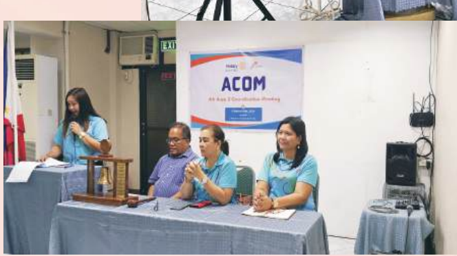
see succeeding reports on pages 10 - 13...