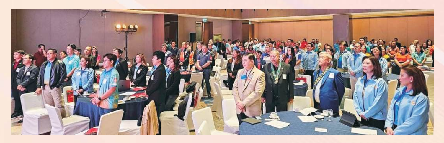
September 7, 2024 Attended the Vibrant Seminar held at Acacia Hotel.