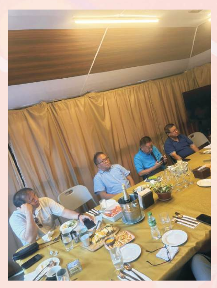
September 3, 2024 2nd Monthly Board of Directors Meeting